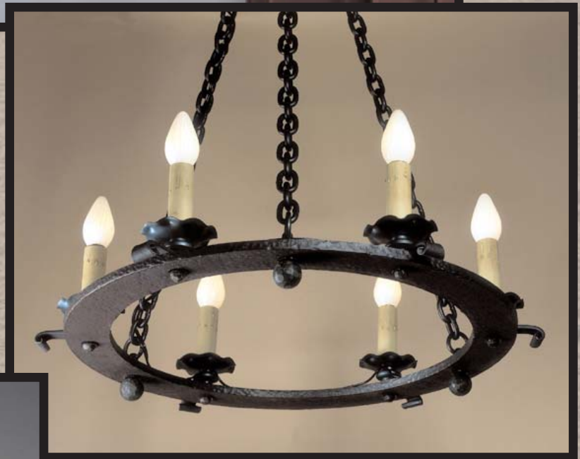
LF530 Hoop Chandelier 6 Candle x 60w Dia= 26" OL=38" 48# TRUCK