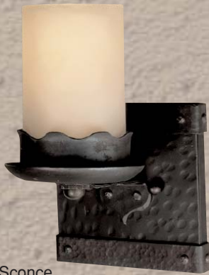
LF517 Votive Sconce H= 10" W=6" Ext=7" 1x60w Shown with Frosted Glass also available: Seeded Glass