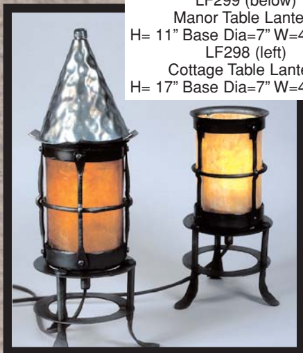
LF299 (below) Manor Table Lantern H= 11" Base Dia=7" W=4" 1x60w LF298 (left) Cottage Table Lantern H= 17" Base Dia=7" W=4" 1x60w