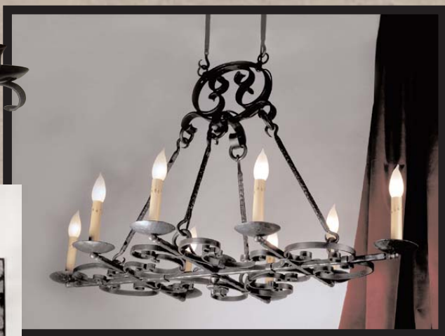
LF521 Burgundy Chandelier (with Oval Hook Connector) 8 Candle Candelabra bulbsx60w W=25" L=40" OL=34 16#