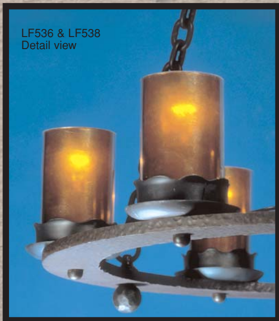
LF536 & LF538 Detail view