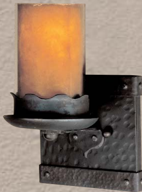
LF517 Shown with Orange Mica