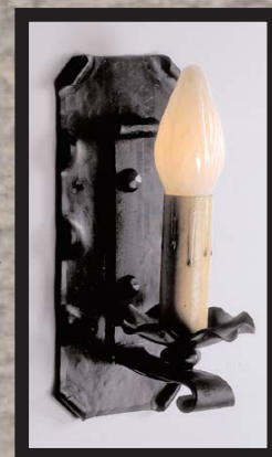
LF510 Scroll Sconce H= 10" W=5" Ext=5" 1x60w