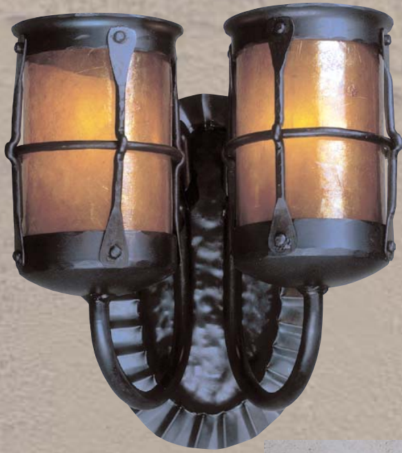
LF401D Double Griffith Lantern H= 10" W=11" Ext=8" 2x60w

LF401D Double Griffith Lantern Shown in inverted position. UL approved for wet location. Available with waterproof "Bronze Coat" finish. (Must specify BZ)