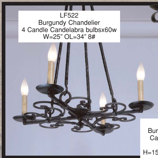
LF522 Burgundy Chandelier 4 Candle Candelabra bulbsx60w W=25" OL=34" 8#