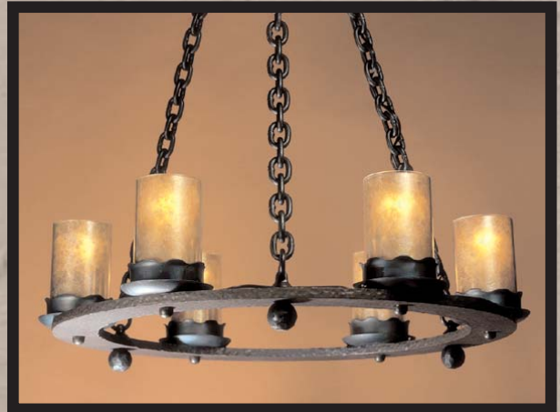
LF536 Shown with orange Mica Also available: Almond Mica & Seeded Glass