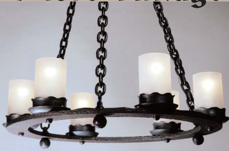
LF536 Votive Chandelier 6 candle x 60w Dia=21" OL=32" 35# TRUCK Shown with Frosted Glass also available LF538 Votive Chandelier 9 candle x 60w 60# TRUCK