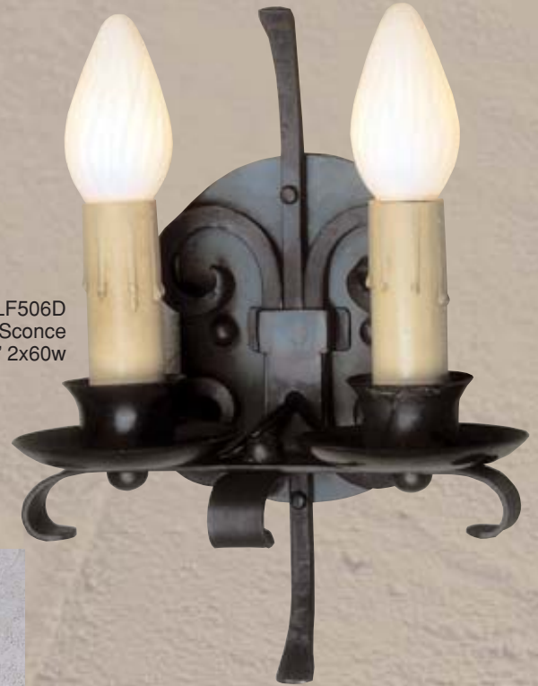
LF506D Double Rancho Sconce H= 11" W=9.5" Ext=5.5" 2x60w