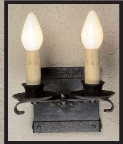
LF514D Double Monterey Sconce H= 10" W=9.5" Ext=6.5" 2x60w