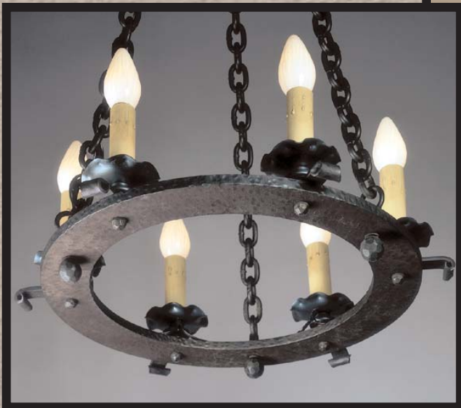
LF528 Small Hoop Chandelier 6 Candle x 60w Dia= 21" OL=38" 37#