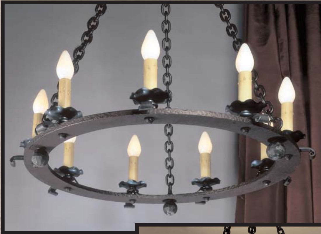
LF532 Hoop Chandelier 9 Candle x 60w Dia= 32" OL=38" 60# TRUCK