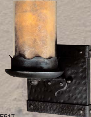
LF517 Shown with Almond Mica