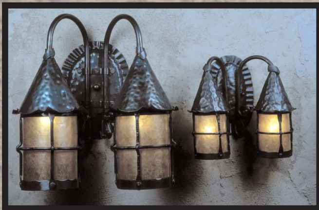
LF301D Double Grande Cottage Lantern H= 20" W=13" Ext=13" 2x100w UL approved for wet location. Available with waterproof "Bronze Coat" finish. (Must specify BZ)