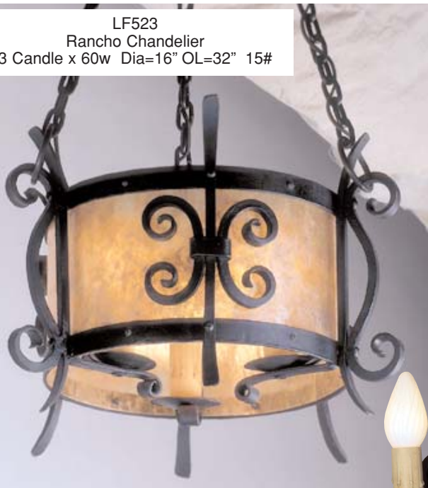
LF523 Rancho Chandelier 3 Candle x 60w Dia=16" OL=32" 15#