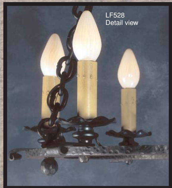
LF528 Detail view