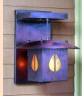
GG04 Sm. Wall Bracket Lantern L=14" W=12" Ext.=14" 1x60w