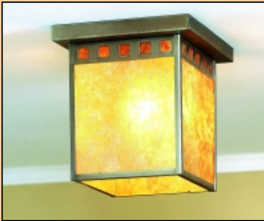
WH04 Sm. Ceiling Mount H=8.5" w=7.25"sq.1x60w WH14 Med. Ceiling Mount H=10.5" w=10"sq.1x100w WH24 Lg. Ceiling Mount H=13" w=14.5"sq.1x100w WH Kit * Orange Mica Window Kit optional = WH Kit