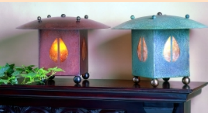
GG99 Table Lantern H= 8" Dia=12" 1x60w