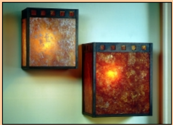
WH13 Med. Pocket Lantern H=9.5" W=8" Ext.=5.5" 1x60w WH23 Lg. Pocket Lantern H=12" W=10" Ext.=6.75" 1x60w * Orange Mica Window Kit Optional = WH Kit