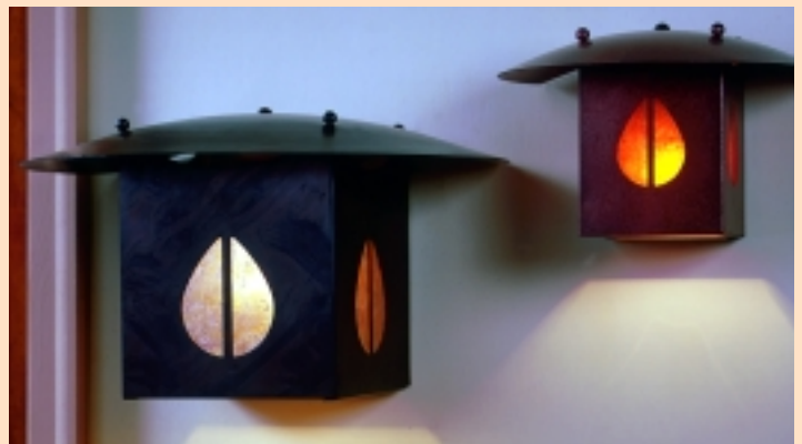
GG22 Lg. Wall Lantern L=11" W=18" Ext.=13.5" 1x100w GG02 Sm. Wall Lantern L=7" W=12" Ext.=9" 1x60w