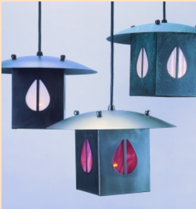
GG01 Sm. Lantern OL=13"-48" Lantern H=7" Dia=12" 1x60w