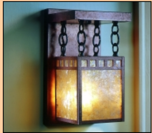
WH03 Sm. Wall Bracket H=14" W=6" Ext.=7.25" 1x60w