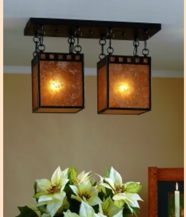
WH08 Sm. Duplex Chandelier OL=13" W=8"x16" 2x60w WH18 Med. Duplex C