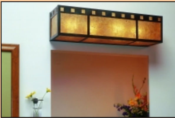
WH124 24" Light Bar H=6" Ext.=6.75" 4x60w WH136 36" Light Bar H=6" Ext.=6.75" 6x60w ** Bottom Cover = BC Standard on Light Bars