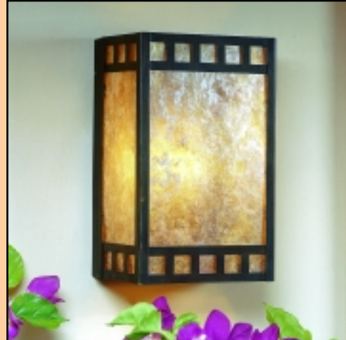
WH02B Sm. Open Top H=10" W=6" Ext.=4.5" 2x60w