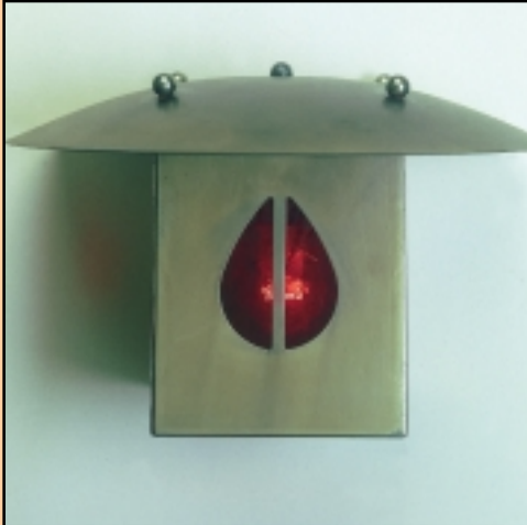
GG02 Sm. Wall Lantern L=7" W=12" Ext.=9" 1x60w GG22 Lg. Wall Lantern L=11" W=18" Ext.=13.5" 1x100w