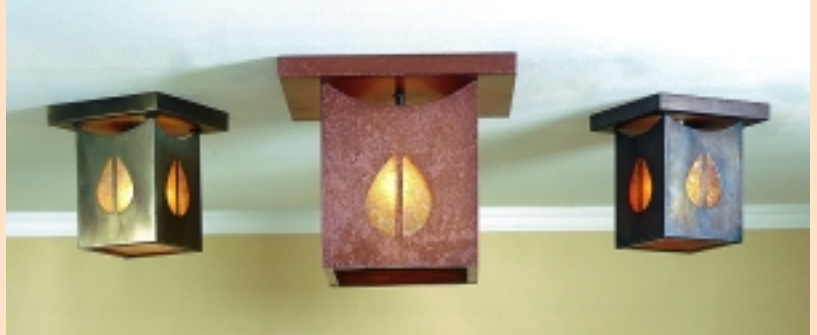
GG12 Sm. Ceiling Lantern L=8" W=7.25"sq. 1x60w GG42 Lg. Ceiling Lantern L=10.5" W=12"sq. 1x100w