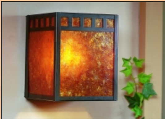
WH02 Sm. Wall Mount H=7" W=6" Ext. = 6.5" 1x60w WH12 Med. Wall Mount H=9.5" W=8" Ext. = 8.5" 1x60w WH22 Lg. Wall Mount H=12" W=10" Ext. = 10.5" 1x60w