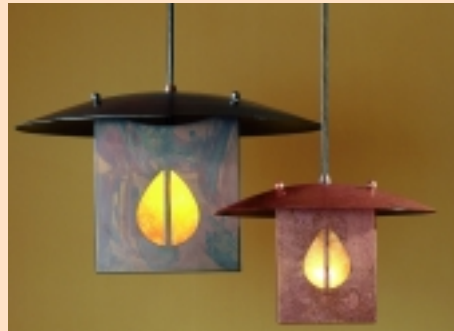
GG21 Lg. Lantern OL=17"-52" Lantern H=11" Dia=18" 1x100w GG01 Sm. Lantern OL=13"-48" Lantern H=7" Dia=12" 1x60w