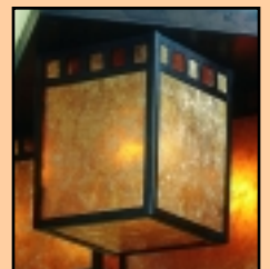
WH77 Sullivan Chandelier Detail: * Orange Mica Window Kit Optional = WH Kit

*Options: WH Kit =Orange Window Kit ** Bottom Cover - Specify Size= BC-WH, BC-GG