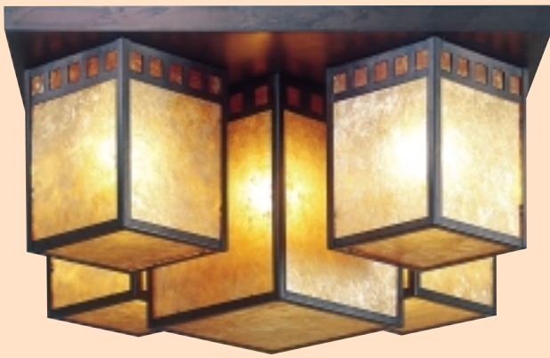
WH77 Sullivan Chandelier L=13" W=22"sq. 5x60w *Orange Window Kit optional = WH Kit ** Bottom Cover = BC Standard on Sullivan