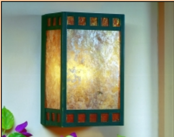
WH02B Sm. Open top H=10" W=6" Ext.=4.5" 2x60w * Orange Mica Window Kit Optional = WH Kit