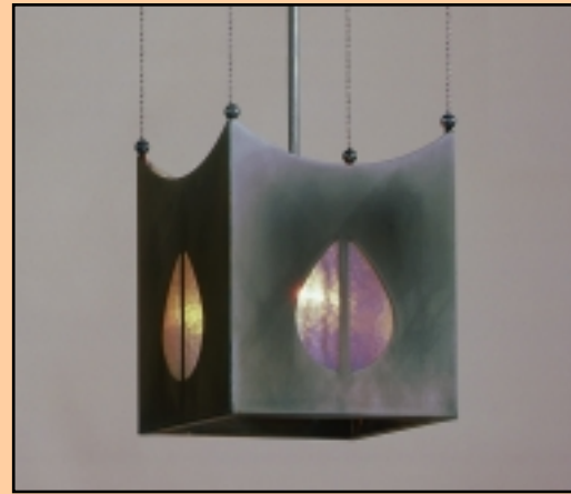
GG11 Sm. Beaded Lantern OL=18" Lantern H=7" W=5" 1x60w GG41 Lg. Beaded Lantern OL=28" Lantern H=9.5" W=8" 1x100w