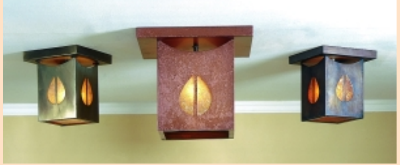
GG12 Sm. Ceiling Lantern L=8" W=7.25"sq. 1x60w GG42 Lg. Ceiling Lantern L=10.5" W=12"sq. 1x100w