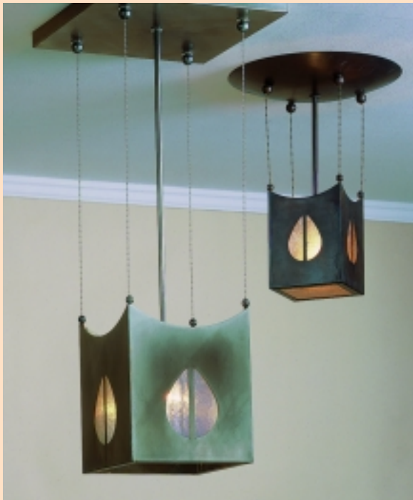
GG11 Sm. Beaded Lantern OL=18" Lantern H=7" W=5" 1x60w GG41 Lg. Beaded Lantern OL=28" Lantern H=9.5" W=8" 1x100w