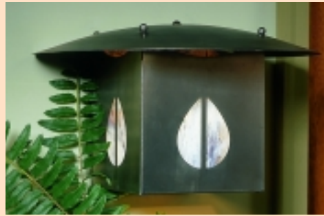
GG22 Lg. Wall Lantern L=11" W=18" Ext.=13.5" 1x100w GG02 Sm. Wall Lantern L=7" W=12" Ext.=9" 1x60w