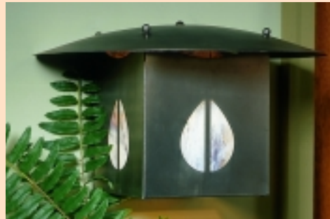
GG22 Lg. Wall Lantern L=11" W=18" Ext.=13.5" 1x100w GG02 Sm. Wall Lantern L=7" W=12" Ext.=9" 1x60w