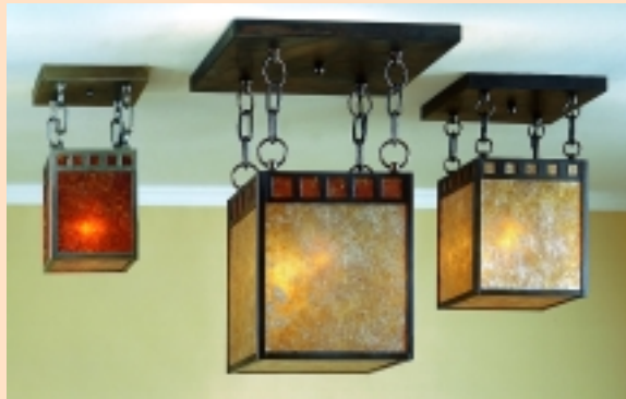
WH01 Sm. Ceiling Loop Mount OL=13" Lantern H=7.5" W=6"sq.1x60w WH11 Med. Ceiling Loop Mount OL=17" Lantern H=9.5" W=8"sq.1x100w WH21 Lg. Ceiling Loop Mount OL=21" Lantern H=12" W=10"sq.1x100w * Orange Window Kit optional = WH Kit