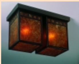
WH06 Sm. Duplex Ceiling Mount H=8.5" W=8"x16" 2x60w WH16 Med. Duplex Ceiling Mount H=10.5" W=23"x10" 2x60w WH26 Lg. Duplex Ceiling Mount H=13" W=36"x12" 2x60w