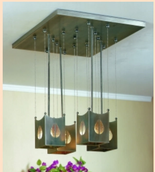
GG17 Beaded Chandelier OL=28" W=19" Canopy = 22"x22" 4x100w