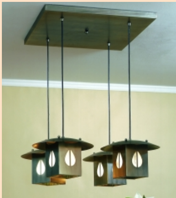
GG07 Glasgow Lantern Chandelier OL=13"-36" W=27" Canopy = 22"x22" 4x100w