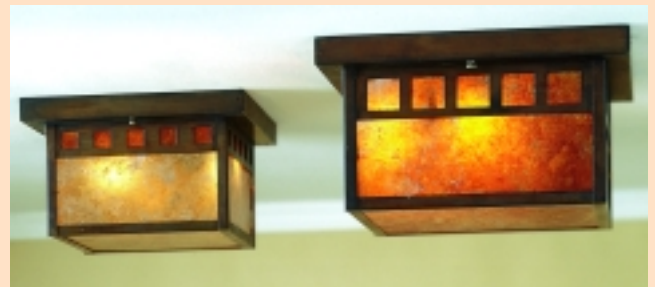
WH15 Med. Square Ceiling Mount 10"sq. L=6" 2x60w WH25 Lg. Square Ceiling Mount 12"sq. L=6.5" 2x60w *Orange Window Kit optional = WH Kit